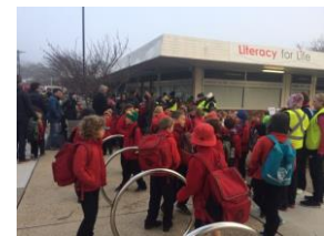
Walk to school Day at Aranda School 2