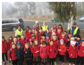
Walk to school Day at Aranda School 1