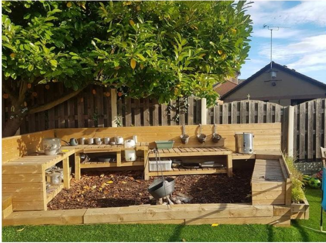
Mud kitchen scheduled to be built in 2022